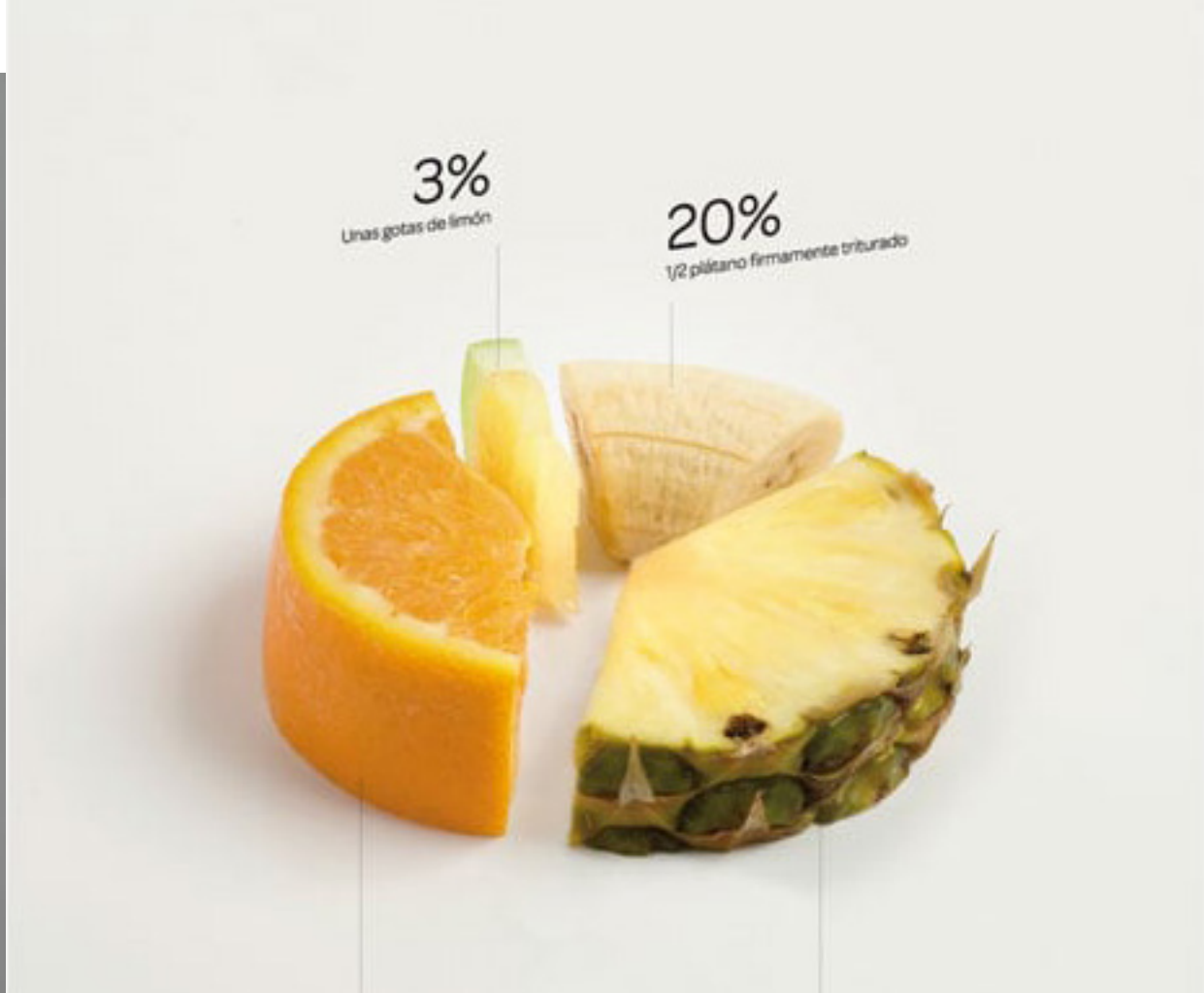
NUTRITIONAL VALUE BY ELEMENT PER SLICE*